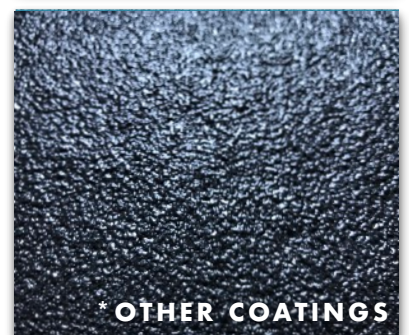
* OTHER COATINGS